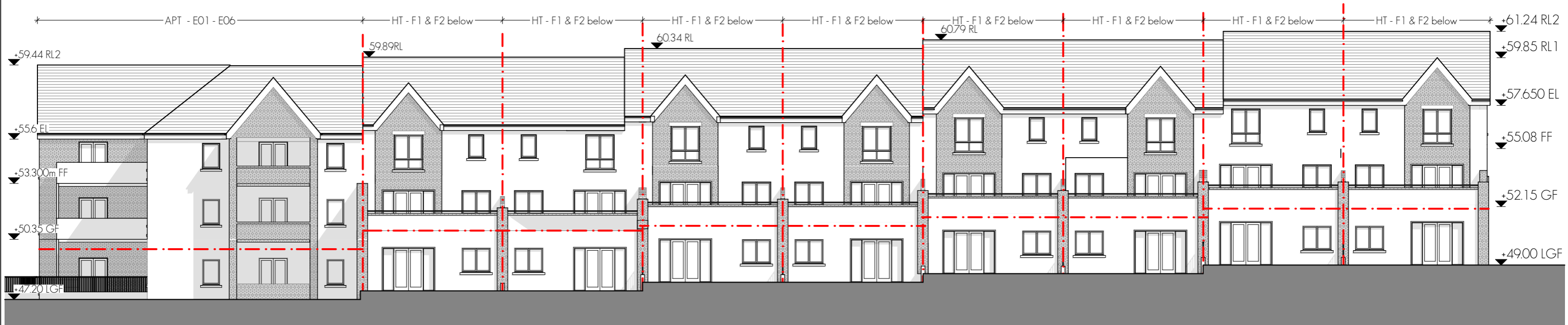
Contextual West Elevation (Rear to woodland)

THIS DRAWING IS FOR PLANNING PERMISSION PURPOSES ONLY. FURTHER DRAWINGS AND STUDIES WILL BE REQUIRED FOR CONSTRUCTION AND TO ENSURE COMPLIANCE WITH RELEVANT BUILDING REGULATIONS AND STANDARDS. NOTE: PLEASE REFER TO THE SITE LAYOUT DRAWING FOR ALL FFLS AND THE NORTH POINT ORIENTATION